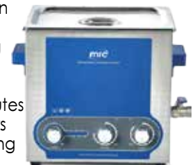
ACP-200H With power control