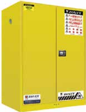
(2), (4) for Flammables, 2 Doors, 114Lit.