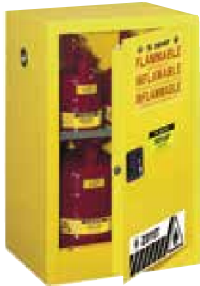
(1), (3) for Flammables, Single Door, 15Lit